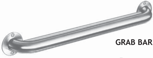
GRAB BAR SA70